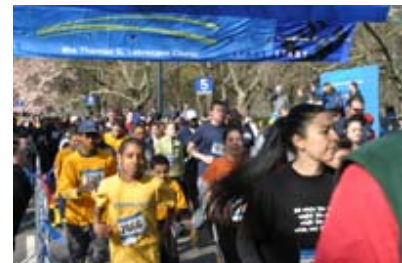
Runners of all ages begin to set the pace as they start the 4-mile run on a sunny Sunday morning in Central Park.