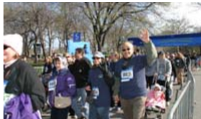
All friends and family members who preferred to take in some scenery, participated in the 1.7 mile health walk!