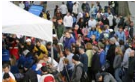
Over 7,400 people registered to run or walk in the 4 th annual 'Run as One' on April 9 th . Our biggest turnout yet!

Thank you to the 7,400 runners and walkers who came out for the 4 th annual Run As One event in Central Park on April 9 th , making it a huge success. And a special thanks to all of our generous friends, donors and sponsors for your support, without which this event would not have been possible.