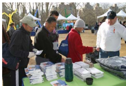
This year's health fair showcased Memorial Sloan-Kettering Cancer Center, CancerCare, Women Against Lung Cancer, Lung Cancer Alliance, and Joan's Legacy.